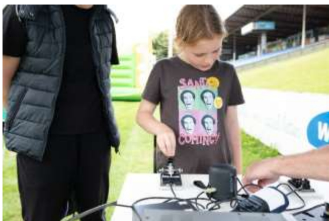
A new op tries her arm on our practice keyer