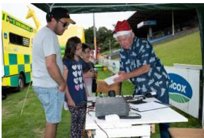
Two visitors learn how to translate their name into Morse