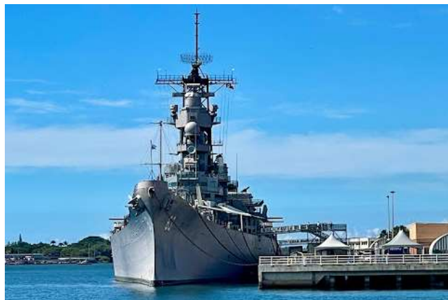
USS Missouri Museum Ship – Pearl Harbour, Hawaii