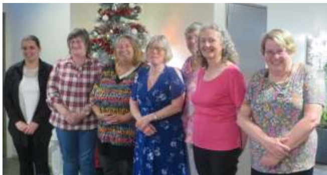
Seven transmitting YLs at Papakura-Franklin dinner

Our shared Christmas dinner with Papakura Club was held recently at Pukekohe Cosmopolitan Club in Ward Street, Pukekohe. Forty one amateur ops or spouses attended this event making it our biggest Christmas event in recent times. The sliced roast beef was an especial favourite in the menu. As usually happens, members of both clubs rotated table by table to catch up on the events of the year. It was great to see newly licenced hams for 2023 from both clubs turning up for the party.